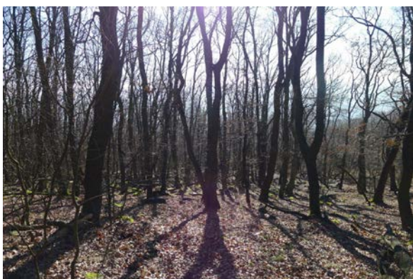
Spring at Zobor hill, Slovakia. 2016

Wishing you interesting reading and looking forward to receive your comments and inputs for the next issue of the LE-News.