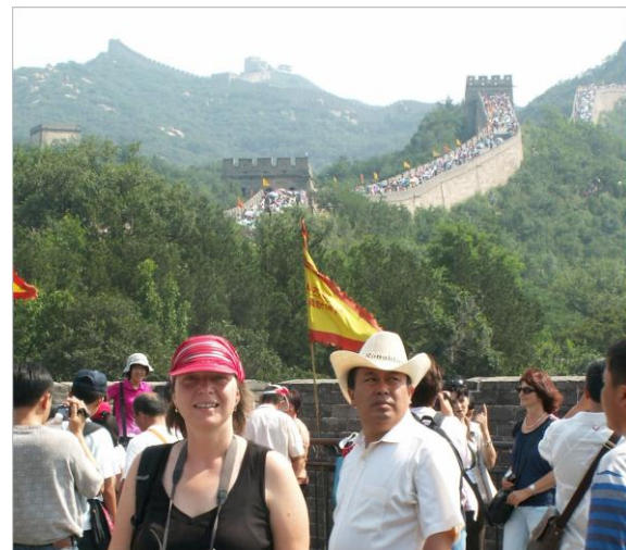
Mid-Congress Excursion to the Great Wall

The success of the 8 th IALE World Congress in Beijing not only boosted communication and cooperation among researchers from different countries, but also represented the academic level in China and broadened the horizons of landscape ecology.