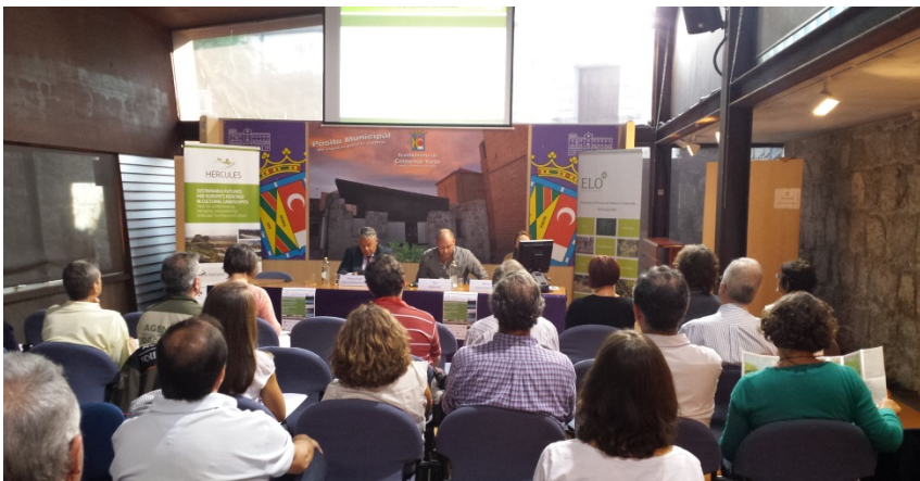
Local stakeholder workshop in Colmenar Viejo, Spain – October 6, 2014

In order to bring together different stakeholders, including policy makers, farmers, practitioners, scientists, NGOs and industry to ensure that all perspectives are considered both at both at EU and