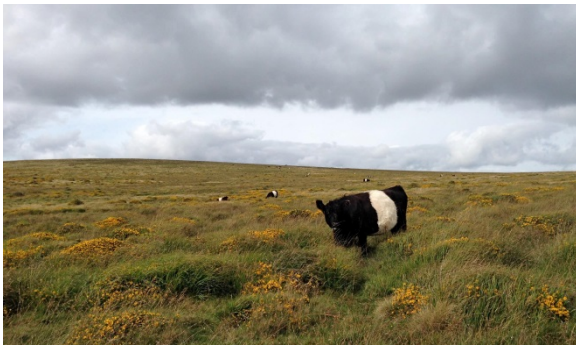
Exposed uplands of Galloway, in South West Scotland

We appreciate cultural landscapes – those landscapes of distinct human shape that surround us – for many different reasons, whether for their cultural heritage, as recreational areas, or for their environmental virtues.